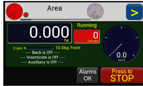
Main screen while running

This has effectively drilled and captured 1/100 th of a hectare's bin product you were testing. Weigh the product collected which will equal 1/100 th of your target weight e.g. 24 kg/ha = 240 g collected.