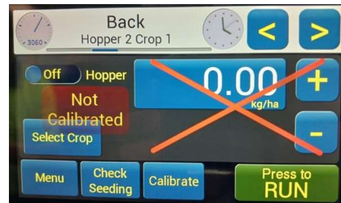
Hopper screen turned off