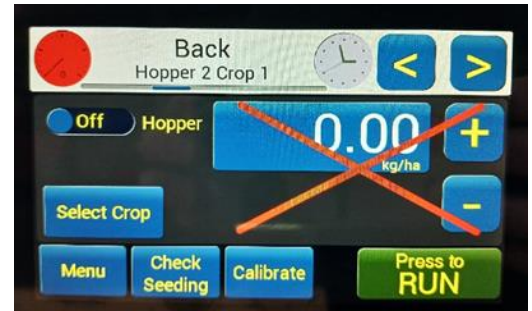
Hopper screen turned off