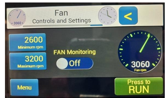
Fan Control screen