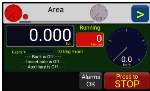
Main screen - running